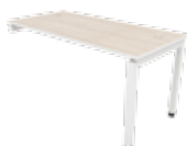
EXECUTIVE WORKSTATION TABLE (R) MODEL SIZE MU 180WT-L 1800x700x750 MU 150WT-L 1500x700x750