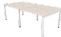
CLUSTER OF 4 MODEL SIZE MU 1504C 3000x1450x750 MU 1204C 2400x1450x750