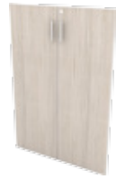
MED. RIGHT & LEFT DOOR MODEL SIZE MW812-2D 796x18x1150