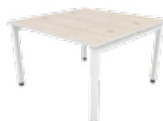
CLUSTER OF 2 MODEL SIZE MU 1502C 1500x1450x750 MU 1202C 1200x1450x750