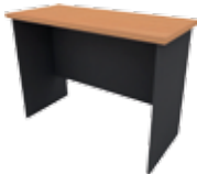
SIDE TABLE MODEL SIZE MP 1067ST2 1000x450x670