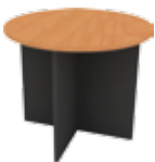
ROUND MEETING TABLE MODEL SIZE MP 6090RT DIA 900x740 MP 6120RT DIA 1200x740