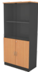
HALF GLASS SWING DOOR CABINET MODEL SIZE MP 8166/GW 800x405x1735