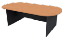
CONFERENCE TABLE MODEL SIZE MP 6180MT 18800x900x750 MP 6240RT 2400x1200x750