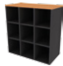
PIGEON HOLE CABINET MODEL SIZE MP 8254/PH 800x405x820