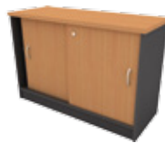
CREDENZA CABINET CABINET MODEL SIZE MP 1069R 1000x450x690